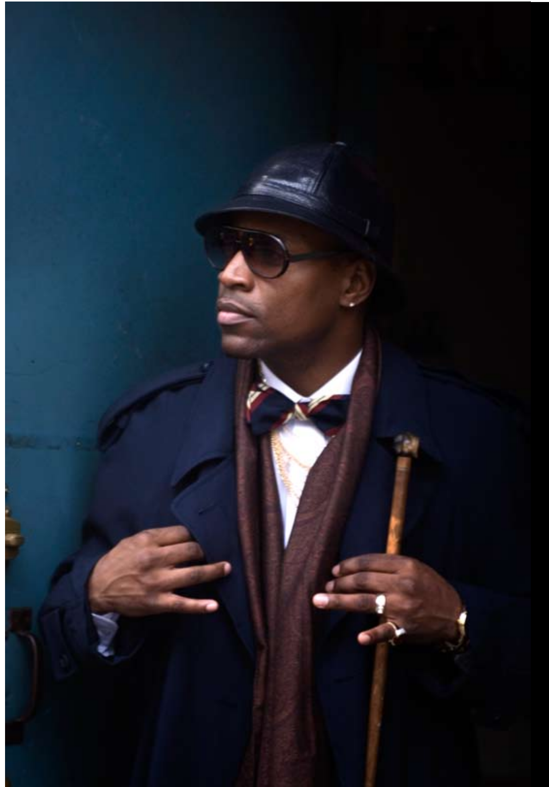
The Great Gatsby